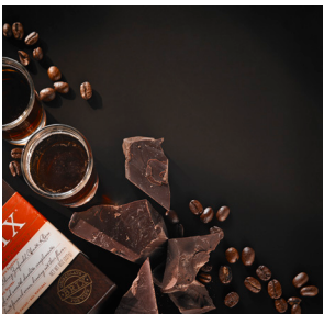
Corian® Deep Espresso

The colors of FILTERED present an escape and offer the chance to daydream. They are at ease throughout the home, yet can also be a comforting spirit in office, retail and hospitality.